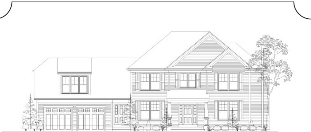
Front View Elevation A