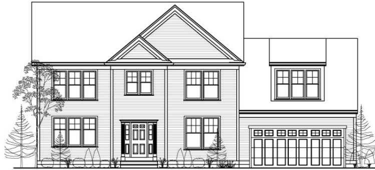
Front View Elevation A