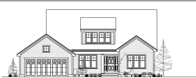
Front View Elevation A