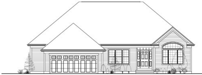
Front View Elevation A